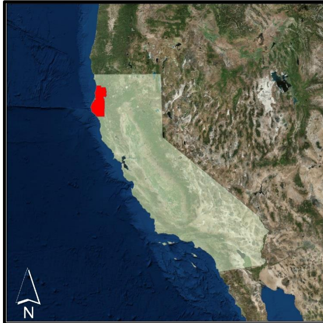
Figure 1. Location of Humboldt County (red) within California.

Humboldt State University is located within Humboldt County in Northern California. Below is a map showing the location of Humboldt County within California.