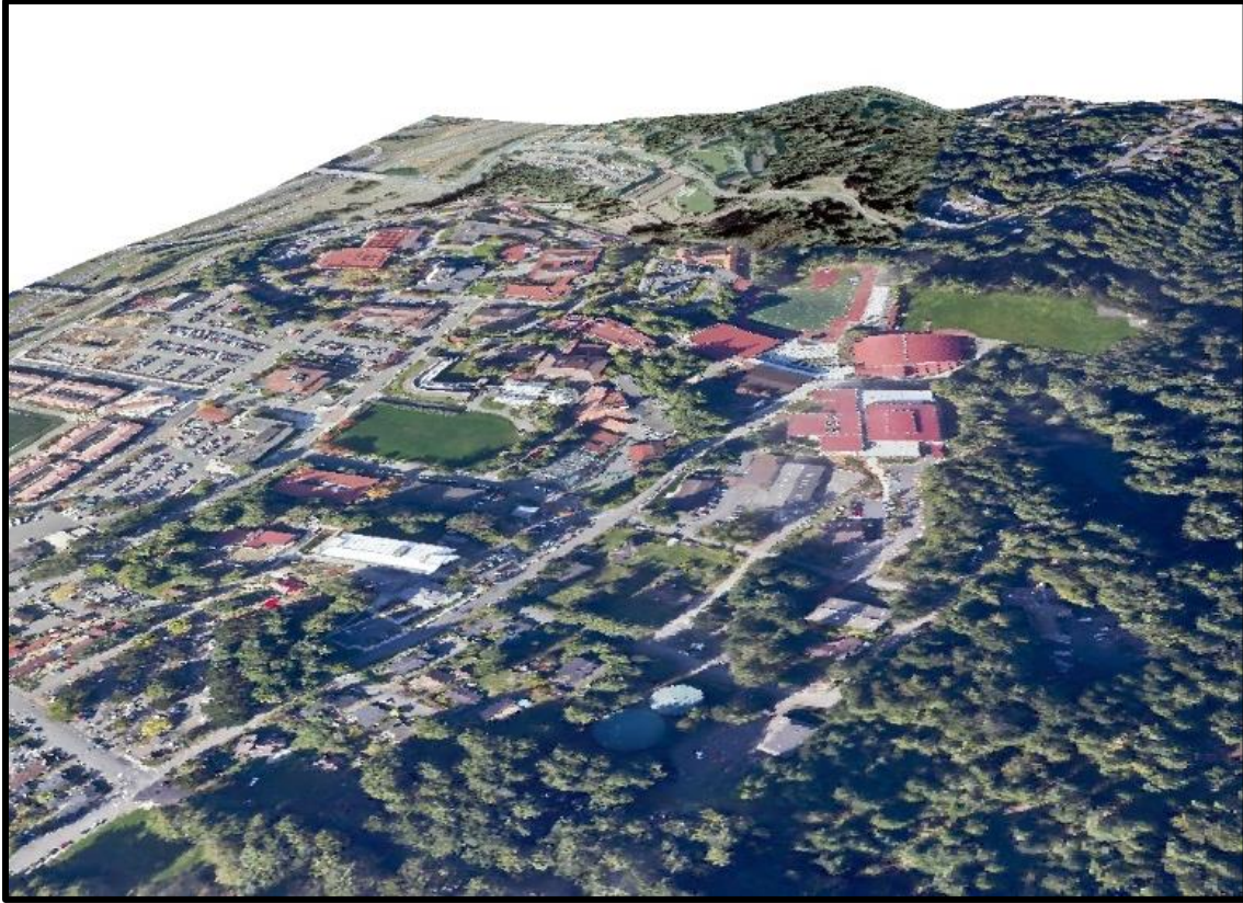
Figure 2. Aerial Photo of Humboldt State University showing a 3D visualization of elevation around campus.